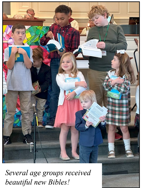
Several age groups received beautiful new Bibles!