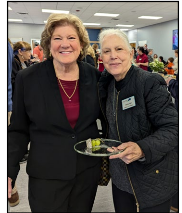
We had a wonderful time of fellowship last Sunday after worship!