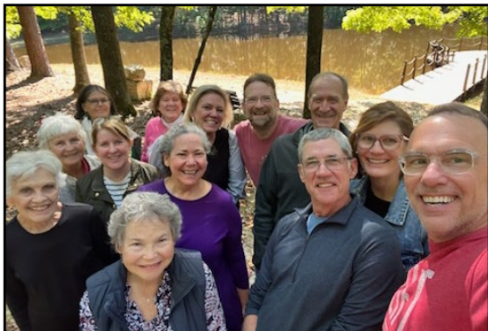
The HMPC Deacons

through Raleigh Rescue Mission and North Raleigh Ministries. These items will be distributed to those in need. We look forward to seeing you at this uplifting and enriching event as we embrace wellness together!