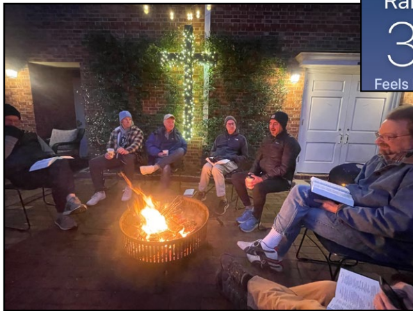
The chilly weather didn't stop this devoted group from meeting outside during January!