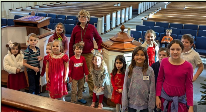
The children have been practicing for weeks on their music for the pageant and Christmas Joy!

Join us for this family-friendly event in Westminster Hall from 10:00am to 12:00pm. This celebration is always a fun-filled, festive morning! Activities include ornament-making, a nativity scavenger hunt, and making gingerbread nativities. Hot chocolate and treats will be available as well! At 9:00am that morning, the children will rehearse in the Sanctuary for Sunday's pageant.