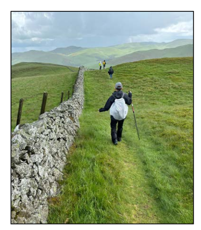
Our group on day 3.

From June 24th to June 31st, Katy and I did a six day, seven night pilgrimage in the borderlands of Scotland and England called St. Cuthbert's Way. It is a 62.5 mile trail that begins in Melrose, Scotland, and concludes on Holy Island (also known as Lindisfarne), England. Twenty-seven years ago, when Katy & I were minister interns in Northern Ireland and vacationing in England & Scotland, we tried to go to Holy Island, but couldn't. You see access to Holy Island has always depended on the tides. There is a road and a pilgrims' path that are only accessible when the tide is out. A quarter of a century ago, when we pulled up in our Vauxhall, the tide was in and we couldn't wait six hours for it to go back out. Katy and I were interested in Holy Island for its Christian history, but also because it was the