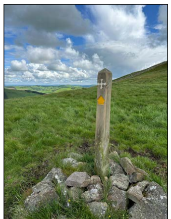
Way marker on the path.

I'll conclude with this Prayer for Pilgrims provided by the churches that are along St. Cuthbert's Way: