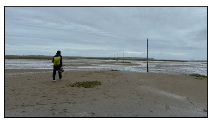
Walking barefoot across the sound to Holy Island on our last day.

As far as highlights, this is one of the most beautiful pilgrimages I've ever done. The Scottish border region is gorgeous. The inns and towns we stayed in had cozy pubs that were fun to sit in at the end of the day and visit with people over a pint. The last day of the pilgrimage was very memorable: When the tide goes out, the tradition is that pilgrims walk barefoot across the sound following tall sticks leading to the island.