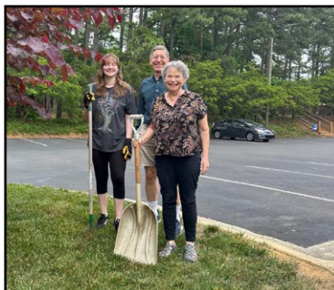
Photos from last spring's campus work day.